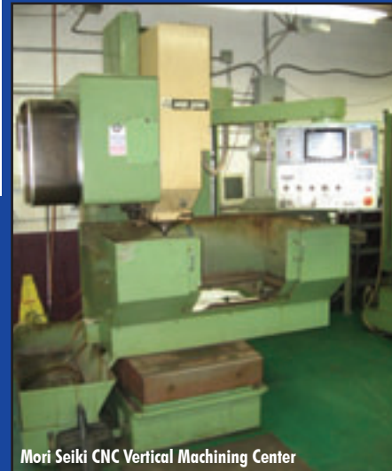
Mori Seiki CNC Vertical Machining Center