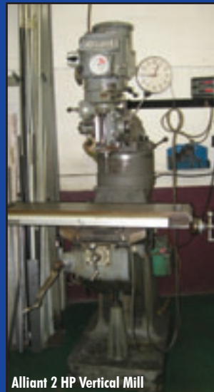
Alliant 2 HP Vertical Mill