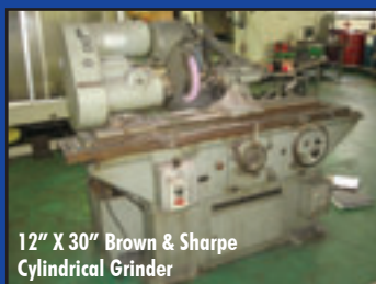
12" X 30" Brown & Sharpe Cylindrical Grinder