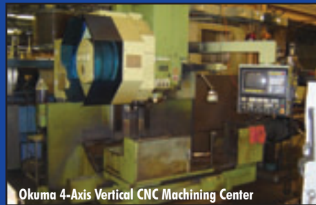
Okuma 4-Axis Vertical CNC Machining Center