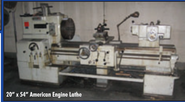
20" x 54" American Engine Lathe

MISCELLANEOUS Tool Holders, Mill Vises, Die Carts, Inspection Equipment, Renishaw Probes, Angle, Plates, End Mills, Drills, Banding Equipment, Rotary Tables, Shop Carts, Benches, Shop Fans, Tools