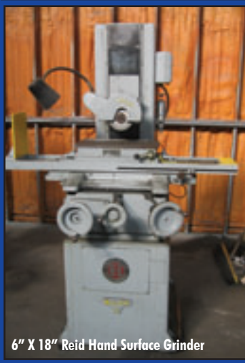
6" X 18" Reid Hand Surface Grinder