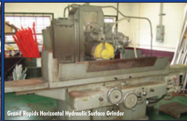
Grand Rapids Horizontal Hydraulic Surface Grinder