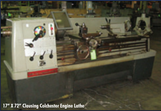
17" X 72" Clausing Colchester Engine Lathe

ENGINE LATHE 17" X 72" Clausing Colchester Engine Lathe, SN: 7/0218/13236, Inch/Metric Threading, 20 - 1,800 RPM, Taper 16" X 108" Lodge & Shipley Engine Lathe, Model A, SN: 40384, Taper Attachment, 15" 4-Jaw Chuck 20" x 54" American Engine Lathe, SN: 78414-67, Spindle Speeds 15 - 1000 RPM, 18" 4-Jaw Chuck, 2" Spindle Hole, Location: Toledo, Ohio