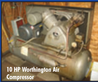
10 HP Worthington Air Compressor