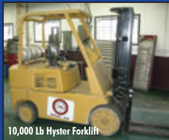
10,000 Lb Hyster Forklift