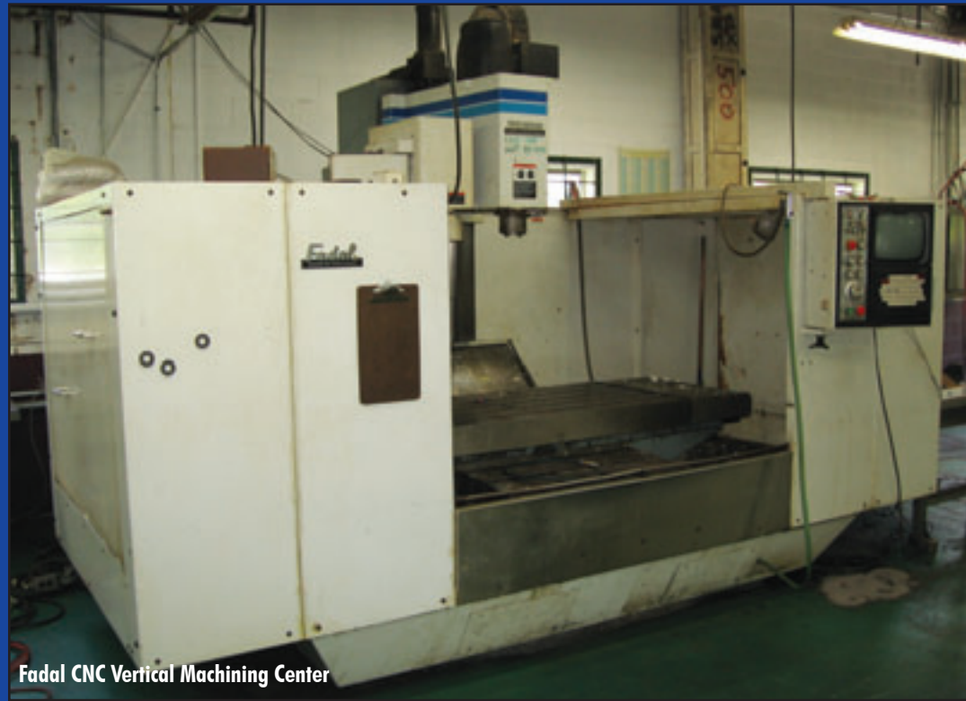
Fadal CNC Vertical Machining Center