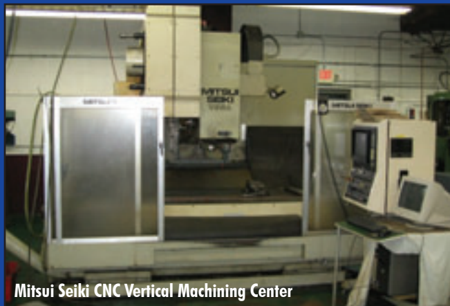
Mitsui Seiki CNC Vertical Machining Center

Mitsui Seiki CNC Vertical Machining Center, Model VS5A, Fanuc 11M Control, 30-Position Tool Changer