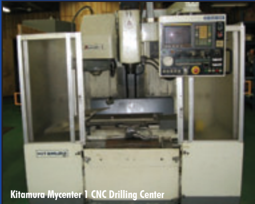
Kitamura Mycenter 1 CNC Drilling Center