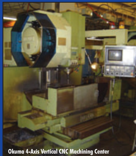
Okuma 4-Axis Vertical CNC Machining Center