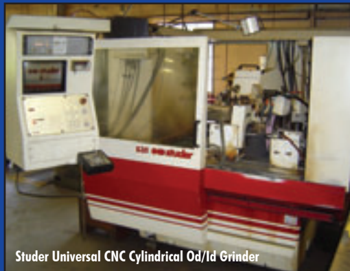
Studer Universal CNC Cylindrical Od/Id Grinder