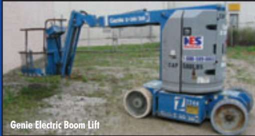
Genie Electric Boom Lift