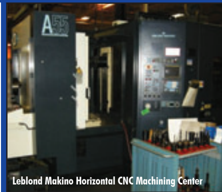
Leblond Makino Horizontal CNC Machining Center

Charmilles Robofil 290F CNC Wire EDM, SN: 330002, 15.75" X-Axis Travel, 9.8" Y-Axis Travel, 8" Z-Axis Travel, (1995)