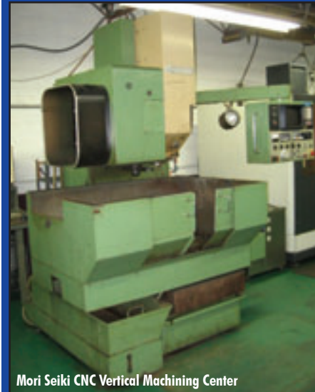
Mori Seiki CNC Vertical Machining Center