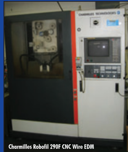
Charmilles Robofil 290F CNC Wire EDM