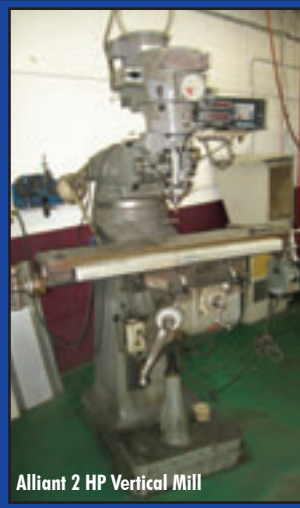
Alliant 2 HP Vertical Mill