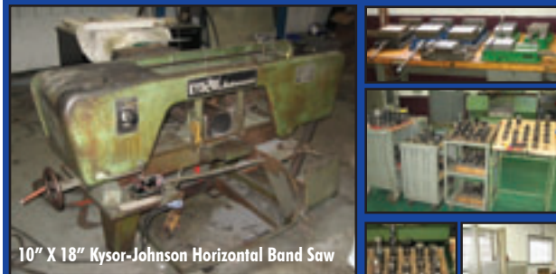
10" X 18" Kysor-Johnson Horizontal Band Saw