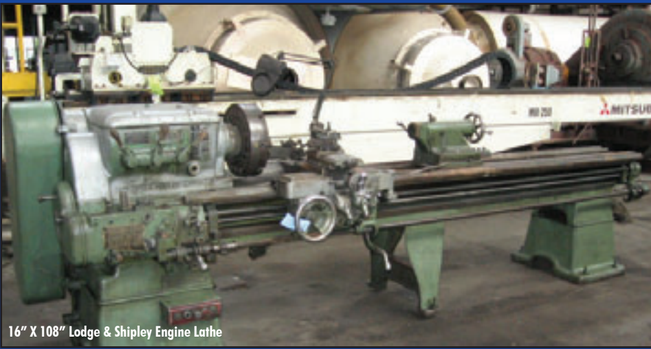
16" X 108" Lodge & Shipley Engine Lathe