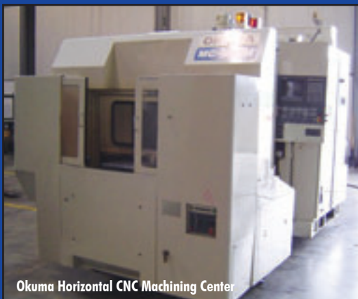
Okuma Horizontal CNC Machining Center