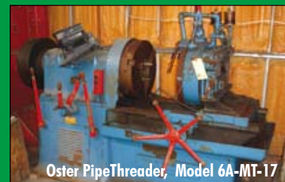
Oster Pipe Threader, Model 6A-MT-17