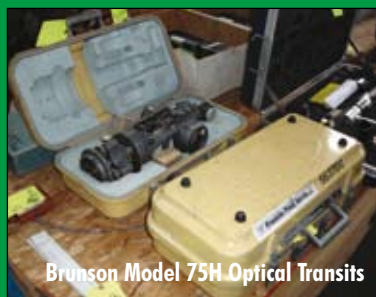
Brunson Model 75H Optical Transits