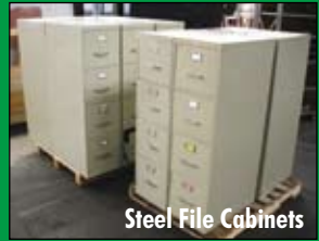
Steel File Cabinets