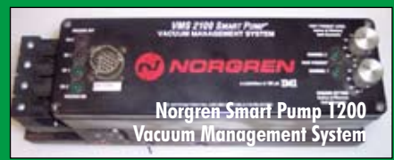
Norgren Smart Pump 1200 Vacuum Management System