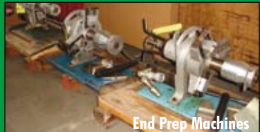
End Prep Machines