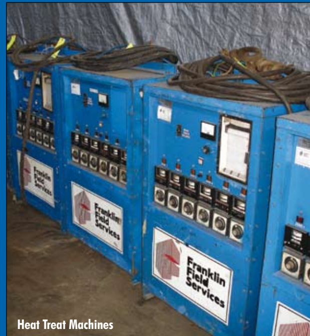
Heat Treat Machines