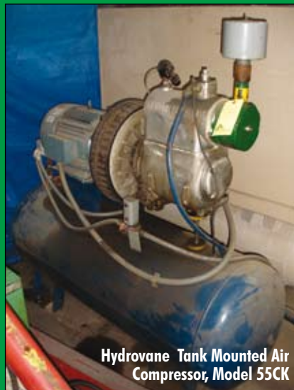
Hydrovane Tank Mounted Air Compressor, Model 55CK