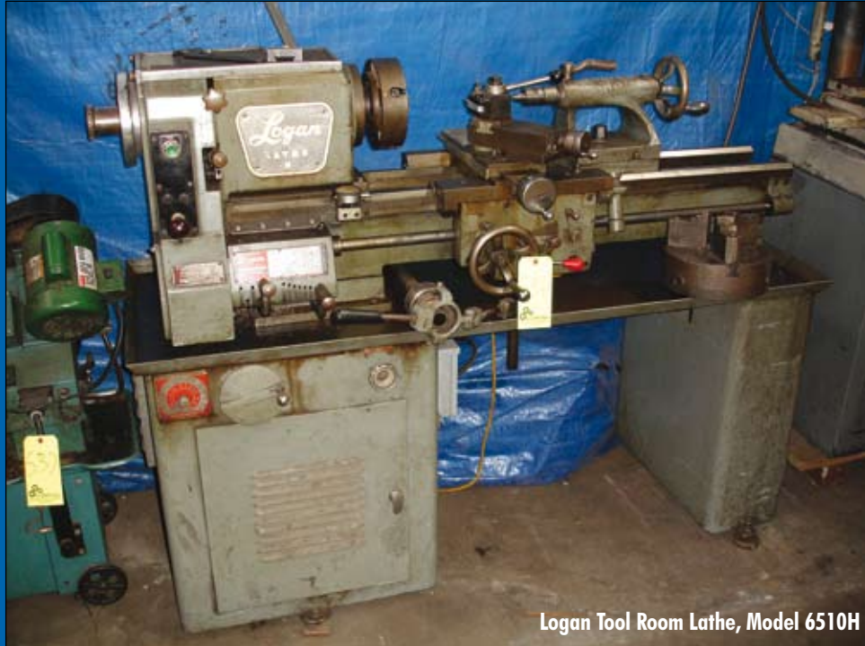
Logan Tool Room Lathe, Model 6510H