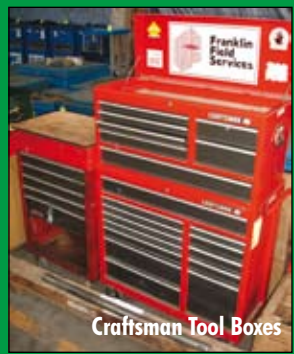
Craftsman Tool Boxes