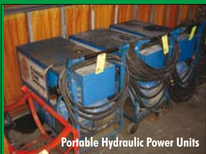
Portable Hydraulic Power Units