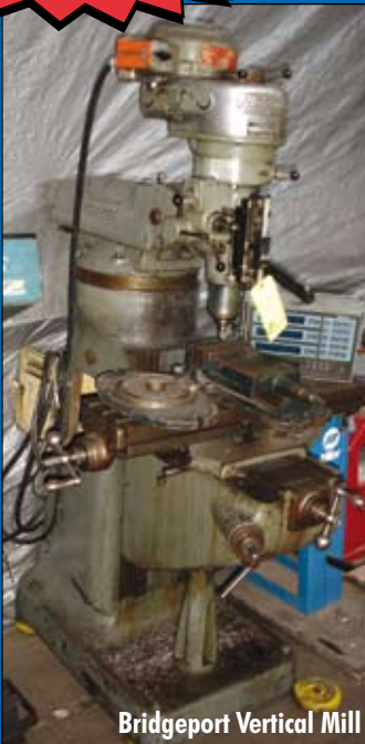
Bridgeport Vertical Mill