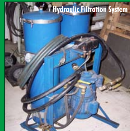
Hydraulic Filtration System