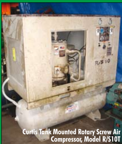
Curtis Tank Mounted Rotary Screw Air Compressor, Model R/S10T