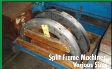
Split Frame Machines, Various Sizes