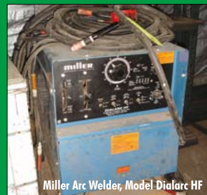
Miller Arc Welder, Model Dialarc HF