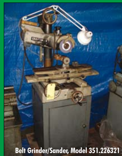
Belt Grinder/Sander, Model 351.226321