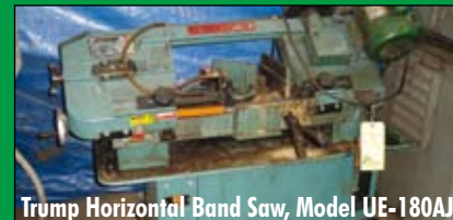
Trump Horizontal Band Saw, Model UE-180AJ