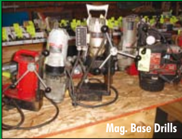
Mag. Base Drills