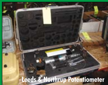
Leeds & Northrup Potentiometer