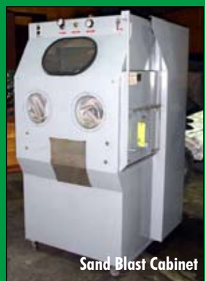
Sand Blast Cabinet