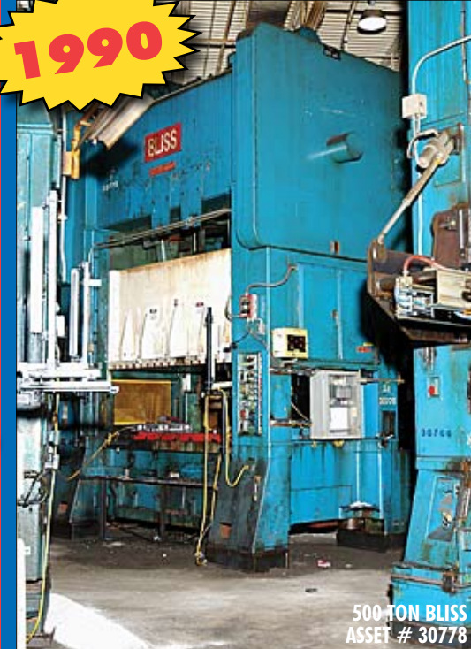
500-TON BLISS ASSET # 30778