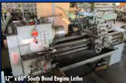
17" x 60" South Bend Engine Lathe