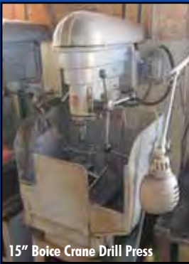
15" Boice Crane Drill Press