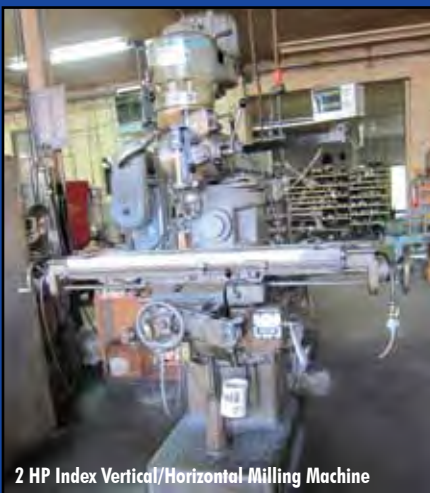
2 HP Index Vertical/Horizontal Milling Machine