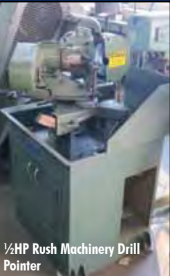
1/2HP Rush Machinery Drill Pointer