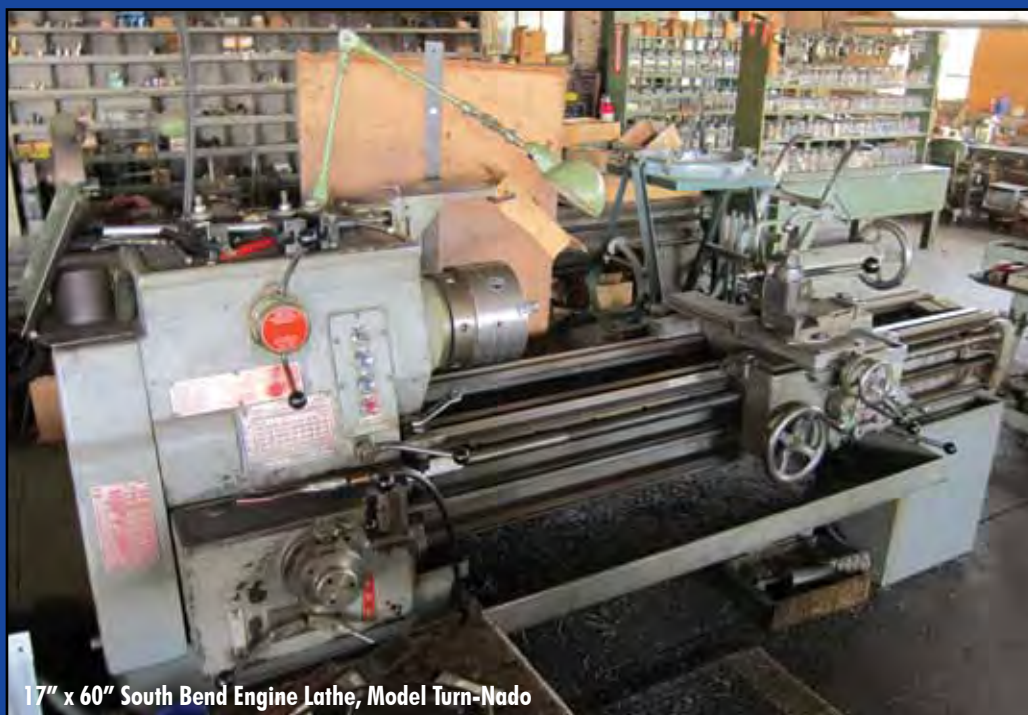
17" x 60" South Bend Engine Lathe, Model Turn-Nado

South Bend 17" Engine Lathe, Model Turn-Nado, S/N: 67GJ1417, 17" Swing, 60" Center Distance, 3-Jaw Chuck, Threading, Chasing Dial, Taper Attachment, Aloris Quick Change Tool Post, Model CA, 30-1580 RPM Spindle Speeds, Tray Top, Chuck Guard, 8' Bed Length, Manual Stop, Light, Catalogue # CL170-E