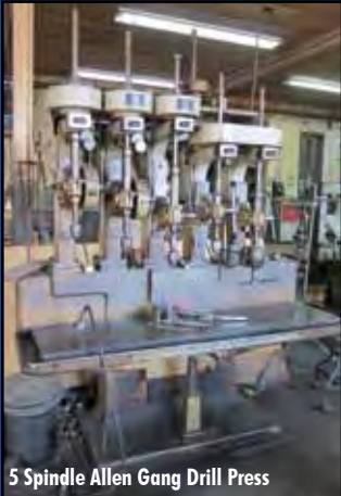
5 Spindle Allen Gang Drill Press