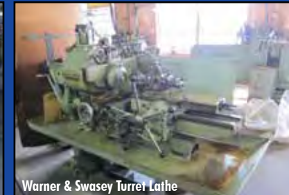
Warner & Swasey Turret Lathe