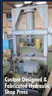
Custom Designed & Fabricated Hydraulic Shop Press