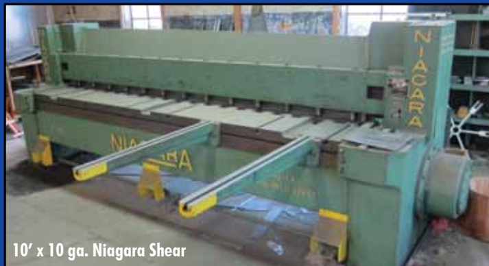
10' x 10 ga. Niagara Shear

Niagara 10' Shear, Model 610, S/N: 45445, Manual Back Gage, 10 Gage Mild Steel Capacity, (2) Sheet Metal Holders, 41" Long, Hydraulic Hold Downs, 5-HP Motor