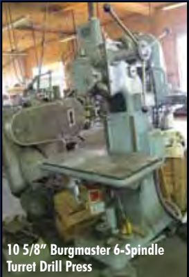
10 5/8" Burgmaster 6-Spindle Turret Drill Press