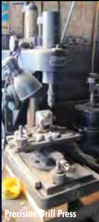
Precision Drill Press