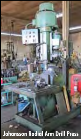
Johansson Radial Arm Drill Press