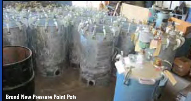
Brand New Pressure Paint Pots