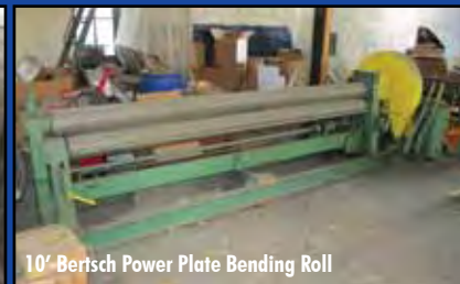
10' Bertsch Power Plate Bending Roll