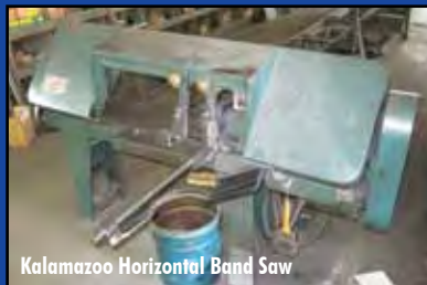
Kalamazoo Horizontal Band Saw