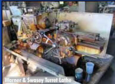
Warner & Swasey Turret Lathe