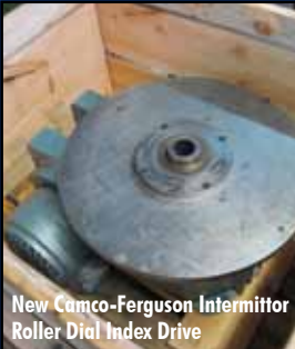
New Camco-Ferguson Intermittor Roller Dial Index Drive