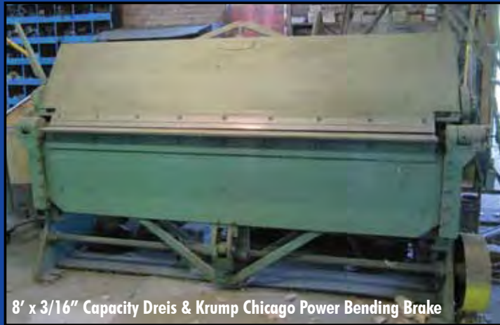
8' x 3/16" Capacity Dreis & Krump Chicago Power Bending Brake