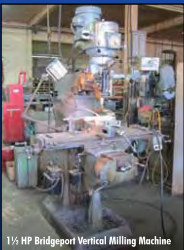
1 1/2 HP Bridgeport Vertical Milling Machine