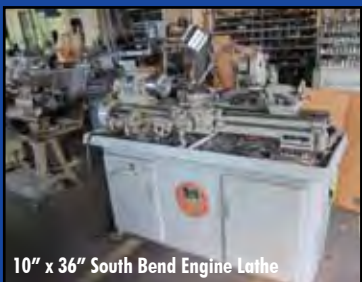
10" x 36" South Bend Engine Lathe