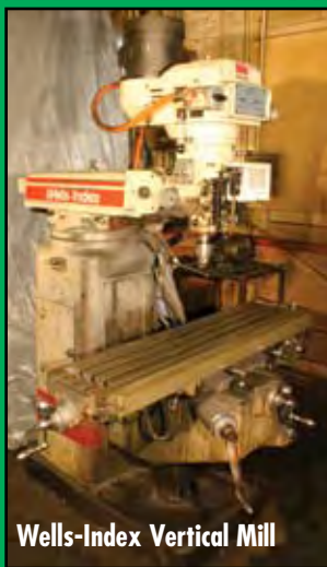
Wells-Index Vertical Mill

A.M. • INSPECTION WEDNESDAY, OCTOBER 4 TH • 9 A.M. - 4 P.M. A.M. • EVERYTHING MUST GO! • DON'T MISS THIS SALE!