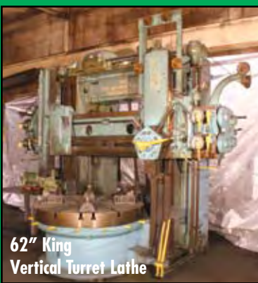
62" King Vertical Turret Lathe

Wells-Index Vertical Mill , 10" x 48" table, 60-4200 RPM, 2-axis D.R.O., power feed on table #5 Tos Mill w/ Vertical Head , 78" x 17" table, 18-1400 RPM, pendant control, 20 HP 1 1/2 HP Bridgeport Vertical Mill , SN 147341, 9" x 42" table, 60-4200 RPM, 2 axis D.R.O., power feed on table Shizuoka 3-Axis CNC Vertical Mill , SN 60189, 13" x 51" table, 310-1800 RPM, Summit control Oerlikon #MN3V Vertical Mill , SN 012189, 14" x 63" table, 30-1500 RPM, ISO 50 taper, 2-axis D.R.O. Sajo #PF 54 Horizontal Mill , SN 752146, NMTB 50 taper, 13" x 59" table, 30-1500 RPM 51" x 210" Cincinnati Planer Mill , SN 1089, 60" under rail, 62" between columns, 51" x 210" table, railhead speed 15-480 RPM