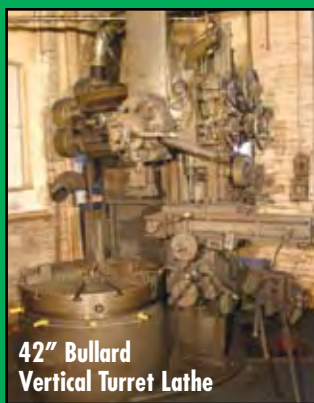
42" Bullard Vertical Turret Lathe