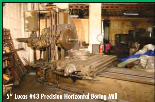
5" Lucas #43 Precision Horizontal Boring Mill