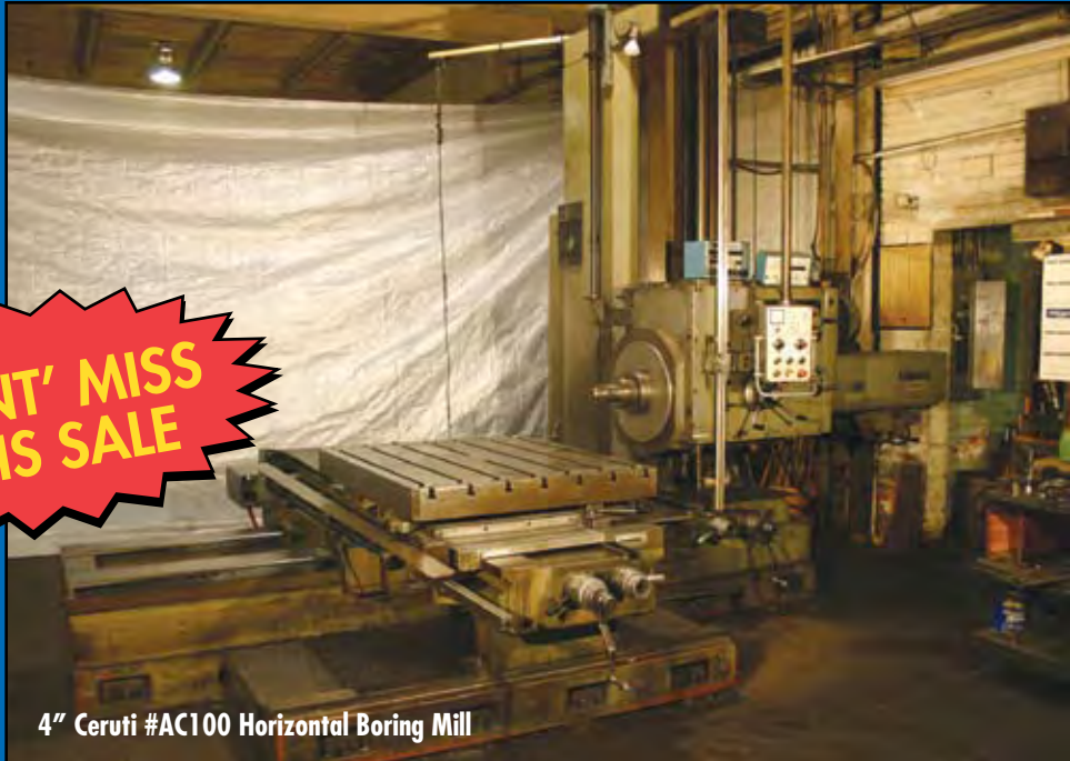
4" Ceruti #AC100 Horizontal Boring Mill