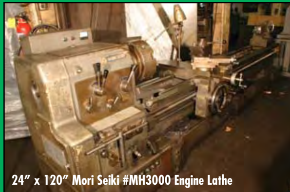
24" x 120" Mori Seiki #MH3000 Engine Lathe