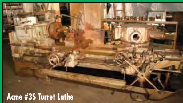
Acme #3S Turret Lathe