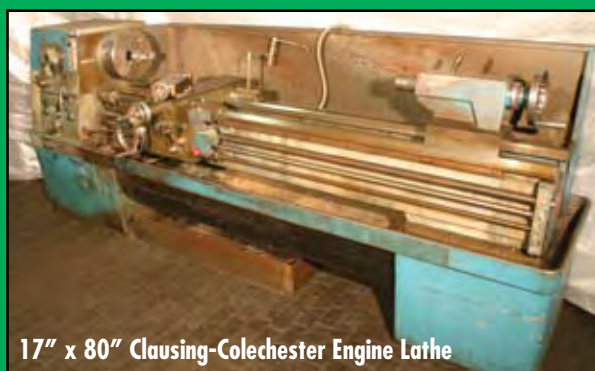
17" x 80" Clausing-Colechester Engine Lathe

17" x 84" Southbend (Turnado), SN 67-GJ-1409, speeds 30-1580 taper, 3 jaw chuck