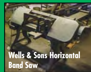
Wells & Sons Horizontal Band Saw

Marvel #8 Vertical Band Saw , 18" x 18" capacity, power head feed Grob #4V-24 Vertical Band Saw , SN 1550, blade welder, 24" x 28" table Wells & Sons Horizontal Band Saw , 2 post type 8" x 16" Kalamazoo Horizontal Band Saw Craftsman Radial Arm Saw