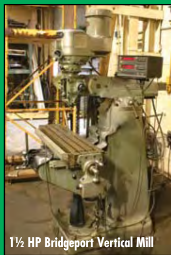
1 1/2 HP Bridgeport Vertical Mill