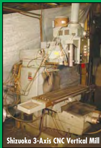
Shizuoka 3-Axis CNC Vertical Mill