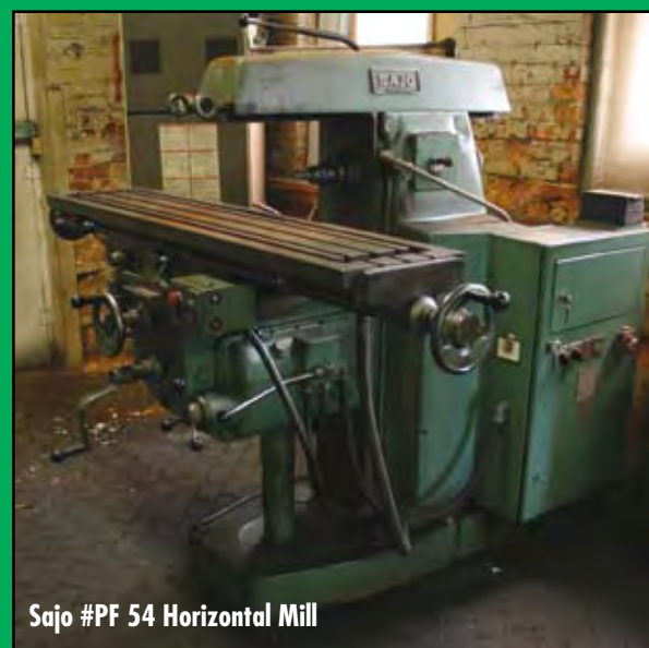
Sajo #PF 54 Horizontal Mill

WE PAY CASH FOR REFERRALS! PROXY BIDS AVAILABLE - 419-536-4445