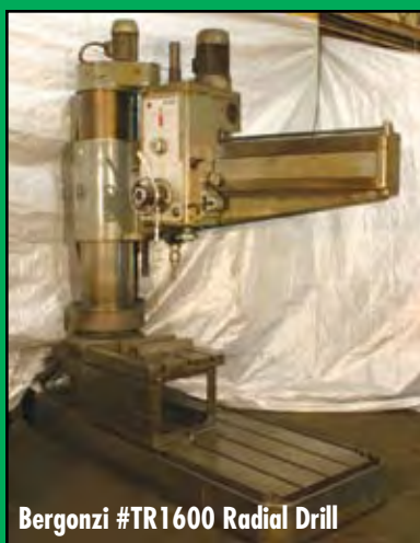
Bergonzi #TR1600 Radial Drill