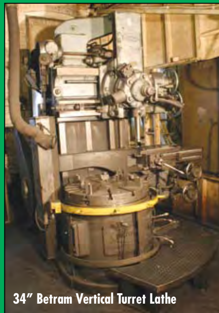
34" Betram Vertical Turret Lathe