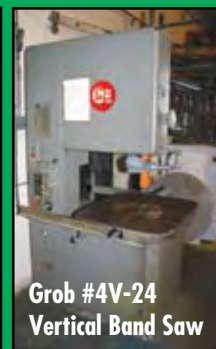
Grob #4V-24 Vertical Band Saw