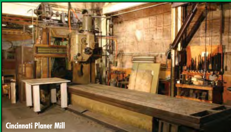
Cincinnati Planer Mill