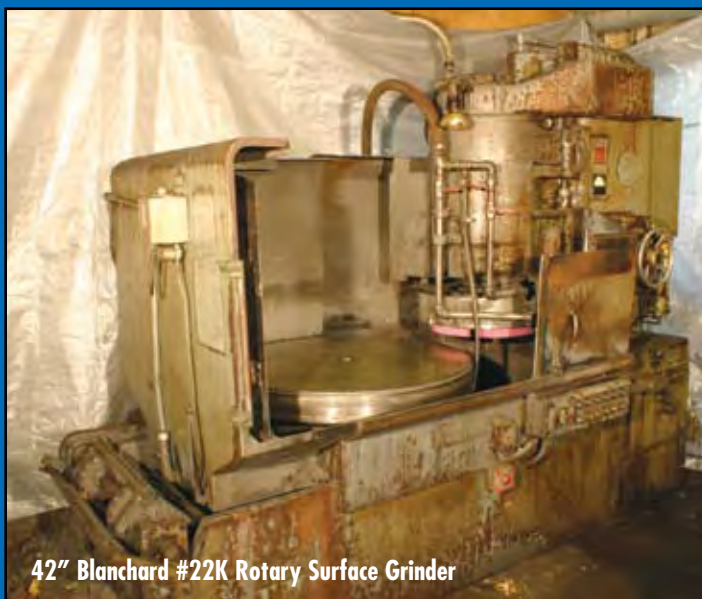
42" Blanchard #22K Rotary Surface Grinder