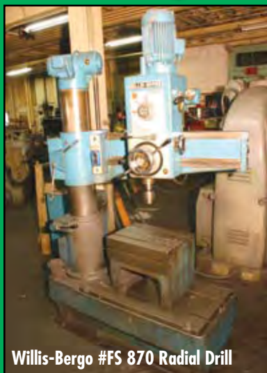
Willis-Bergo #FS 870 Radial Drill