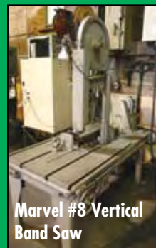
Marvel #8 Vertical Band Saw