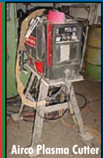
Airco Plasma Cutter