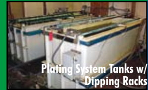
Plating System Tanks w/ Dipping Racks