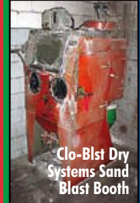
Clo-Blast Dry Systems Sand Blast Booth