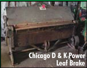
Chicago D & K Power Leaf Brake