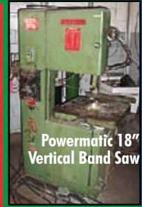
Powermatic 18" Vertical Band Saw