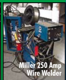
Miller 250 Amp Wire Welder