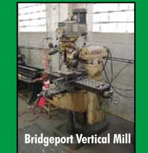
Bridgeport Vertical Mill