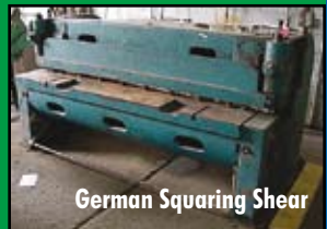
German Squaring Shear