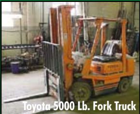
Toyota 5000 Lb. Fork Truck