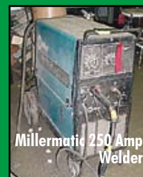
Millermatic 250 Amp Welder