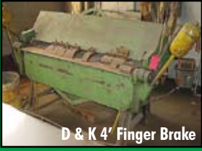
D & K 4' Finger Brake