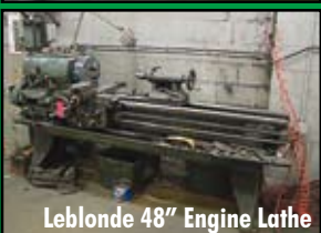
Leblonde 48" Engine Lathe