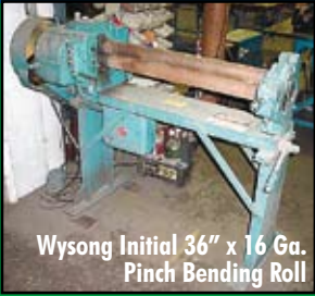
Wyosong Initial 36" x 16 Ga. Pinch Bending Roll