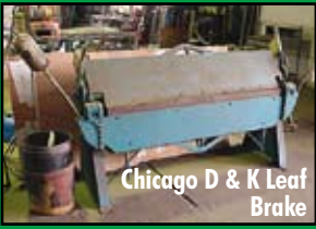
Chicago D & K Leaf Brake