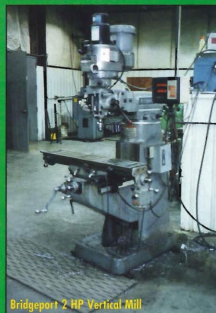
Bridgeport 2 HP Vertical Mill

Miller 300 KVA Stiel Welder, SN HD695773