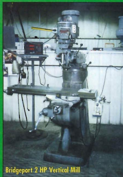
Bridgeport 2 HP Vertical Mill