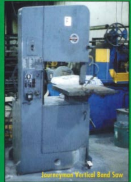
Journeyman Vertical Band Saw

Haberle Mitre Cold Saw , Model #90 Johnson Horizontal Band Saw , Model J, SN 15672, 3 available Journeyman Vertical Band Saw , 24" x 24" table, 18" throat, with welder and grinder