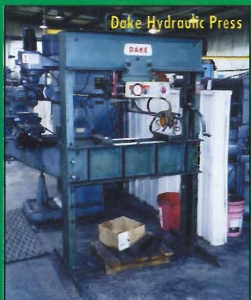
Dake Hydraulic Press

Dake Hydraulic Press, Model 6-275, tonnage monitor KRW 75 Ton Hydraulic Press, SN 1461, hand pump