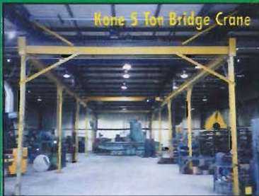
Kone 5 Ton Bridge Crane

Kone 5 Ton Bridge Crane, 20' Span, 65' Runway, pendant control, 3-Way power, 13' maximum lift