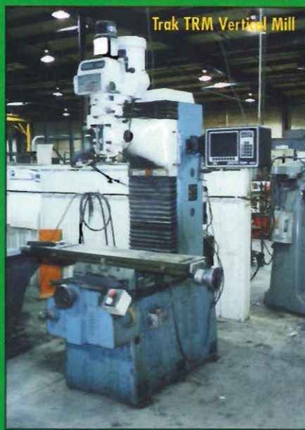
Trak TRM Vertical Mill