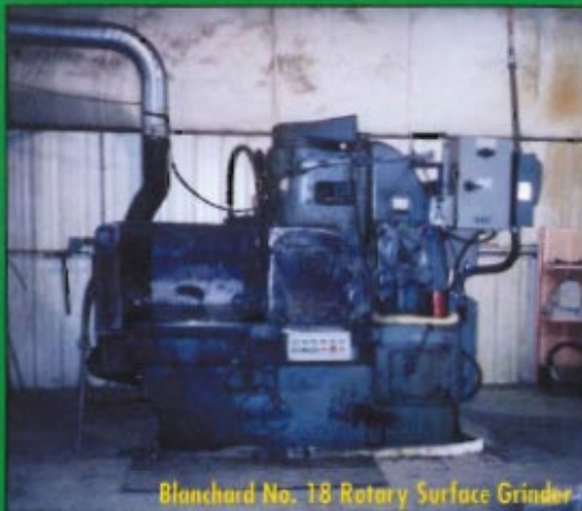
Blanchard No. 18 Rotary Surface Grinder

Blanchard No. 18 Rotary Surface Grinder , SN 4844, 36" jaw chuck, 20" segmented wheel, new electromatic controls, new neutrifier, recent rebuild