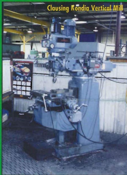
Clausing Kondia Vertical Mill