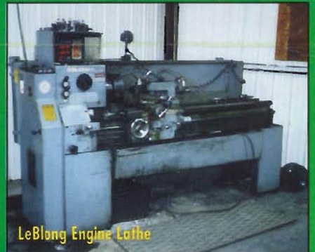
LeBlond Engine Lathe