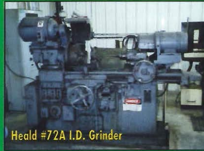
Heald #72A I.D. Grinder

Heald #72A I.D. Grinder, SN 12467 Brown & Sharpe, O.D. Grinder, Model C200261, 8" x 60" capacity, variable speed Norton I.D. Grinder, SN M 1770, 10" x 12" x 48" OD, change gear work head