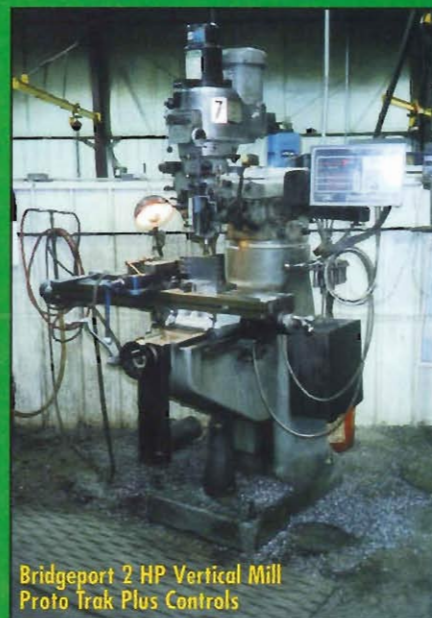
Bridgeport 2 HP Vertical Mill Proto Trak Plus Controls