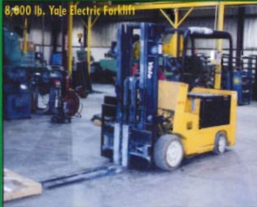
8,000 lb. Yale Electric Forklift

6000 lb. Baker Forklift , propane, hard tires, 42" forks, 130" lift, side shift 8000 lb. Yale Electric Forklift , hard tires, 48" forks, 125' lift, side shift, with charger