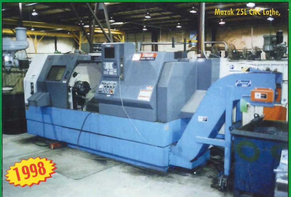
Mazak 25L CNC Lathe,