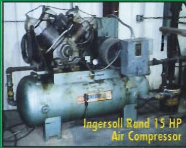
Ingersoll Rand 15 HP Air Compressor

Ingersoll Rand 15 HP Air Compressor, SN 53464 Gardner Denver 20 HP Air Compressor, SN 530688