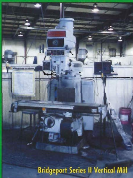
Bridgeport Series II Vertical Mill