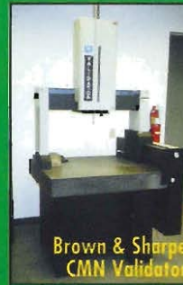
Brown & Sharpe CMN Validator

Delta Lathe, SN 1483384, 14" x 42", taper, 40-1600 RPM, threading, 3 & 4 jaw chuck Clausing Colchester Lathe, SN MCH 26/0003/0091, 17" x 80", 6 jaw chuck, 26-900 RPM, chip pan threading Clausing Colchester Manual Lathe, SN 7/0018/02068, 17" x 78" gap bed, 20-1600 RPM, 3 & 4 jaw chuck, face plate, taper, threading, chip pan Clausing Colchester 15" CNC Lathe, SN 25/003/00191, 15" x 48" Crusader II, Anilam Control. Monarch Engine Lathe, 16" x 54", 12-437 RPM, taper, 3 & 4 jaw chuck, chip pan, taper, threading LeBlond Engine Lathe, 15" x 56", SN 0938, Model 11C-193, DRO taper, tailstock Mazak 25L CNC Lathe, SN 139300, 20" x 40" CC, 8 position turret, Mazatrol 640 Fusion, 3 & 4 jaw, chuck, chip conveyor, tail stock, parts catcher, 1998