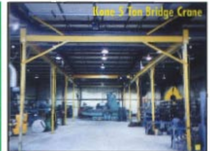
Kone 5 Ton Bridge Crane