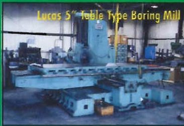
Lucas 5" Table Type Boring Mill

Lucas 5" Table Type Boring Mill, SN 42B1410, Model 542B-120, 48" x 120" table, 60" vertical, 9-1200 RPM, 6" coolant tray, 25 HP 144" cross, good ways