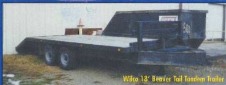
Wilco 18' Beaver Tail Tandem Trailer