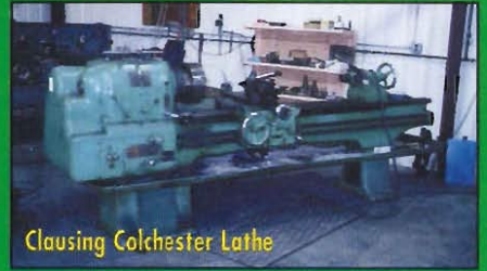
Clausing Colchester Lathe

Brown & Sharpe C & C Validator, 39" x 39" x 18", SN 580-7101-1257 Micrometers, gauges, bench type comparators