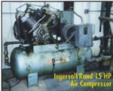
Ingersoll Rand 15 HP Air Compressor