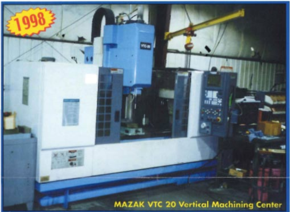
MAZAK VTC 20 Vertical Machining Center