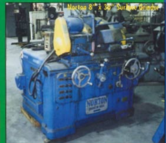
Norton 8" x 36" Surface Grinder

INSPECTION MONDAY, JANUARY 27 TH 8 A.M. - 4 P.M.