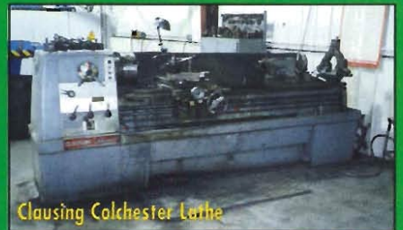
Clausing Colchester Lathe